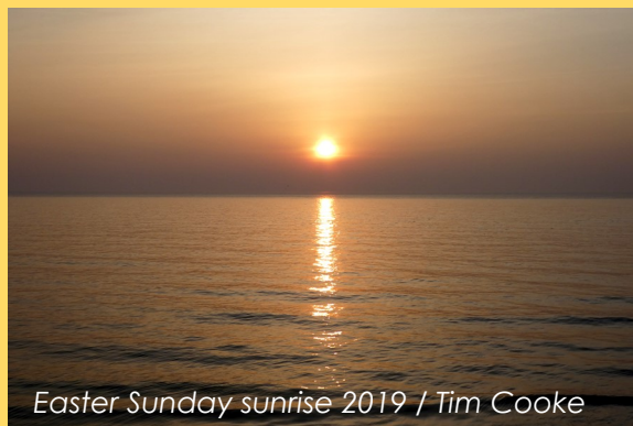
Easter Sunday sunrise 2019 / Tim Cooke