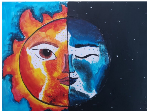
Sophie's latest artwork whilst off school

could make do with just one car. We'd see benefits in having more money each month (for pension and other savings) and have worked out that we should be able to jiggle things round if we both need to go to the office or elsewhere on the same day. We can "make do".