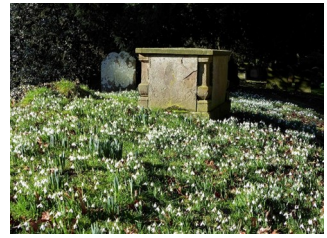
Caring for God's Acre

Snowdrops go by over 30 different local names including dew drops, eve's tear and February Fair Maids. They are also known as Candlemas bells.