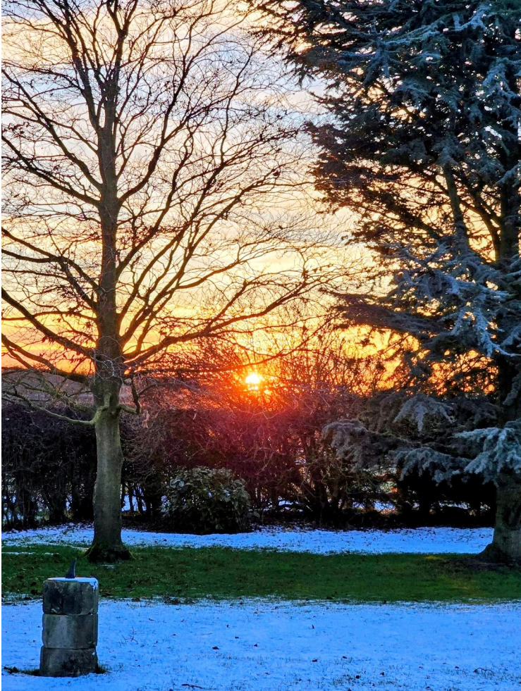
January sunset in East Yorkshire

Musings — Lent discussion — 58 Society Annual Meeting — Spring? — Family fun